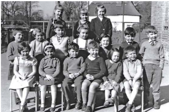
Landbeach Village School circa 1961

The school, now a private residence, is situated at the crossroads in Landbeach, opposite the Village Hall. It was two thirds of a mile from my home, and mum did the journey there and back four times each day, as I went home for lunch.